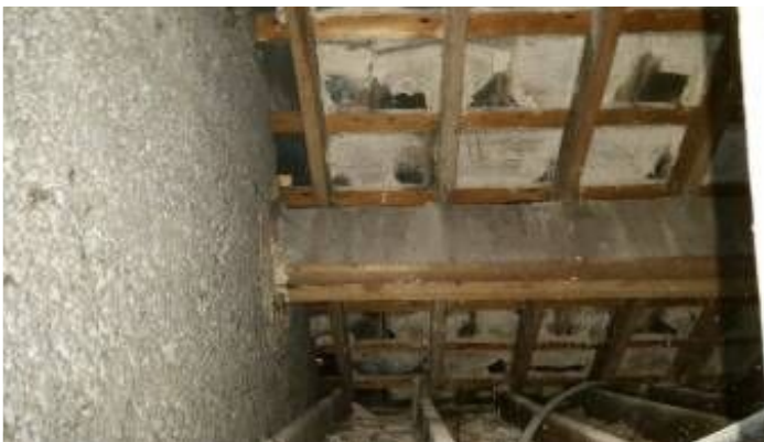
Main roof is constructed of traditional cut roof timbers.

2.5. Recommendation: Spraying recommended to roofspace as a precaution to eradicate common furniture beetle or other wood-boring insects often found in such buildings of this age. Quote to be sought from specialist with guarantee.