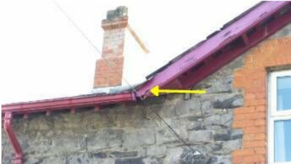
Rotting roof eaves.