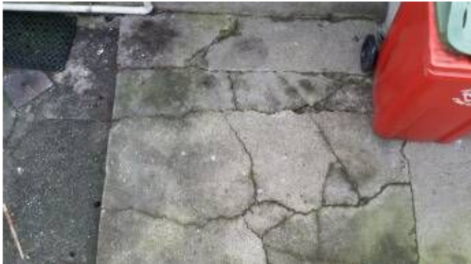
Cracking in path.