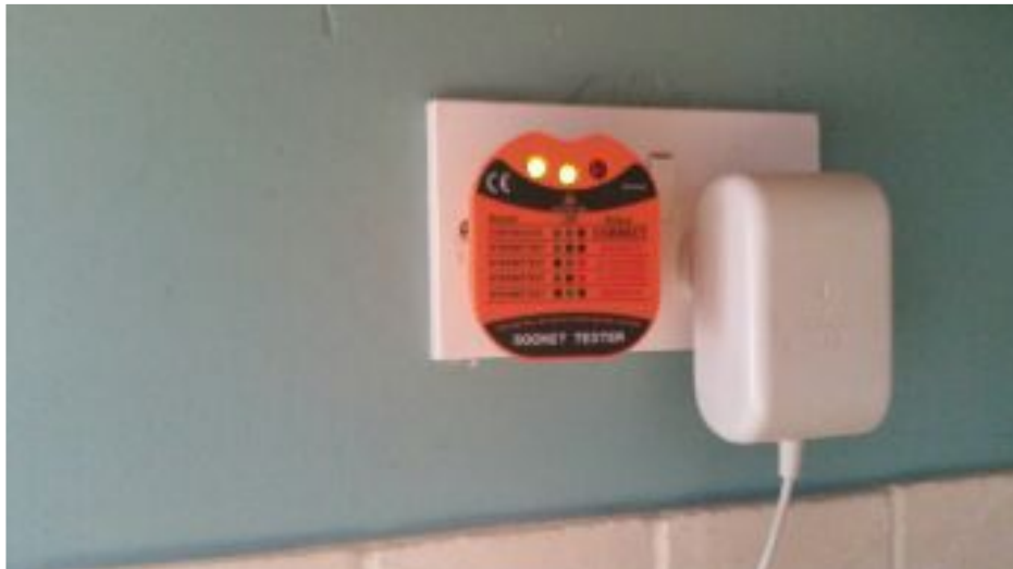
Wiring to plug sockets is earthed.

4.2. Limited number of electrical circuits for modern standards.