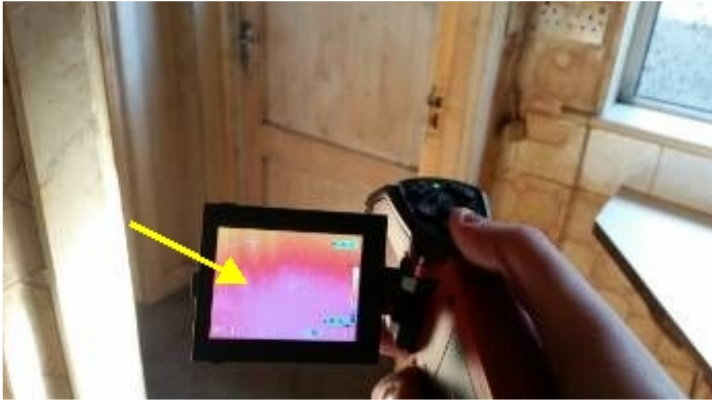
Minimum insulation to exterior doors.