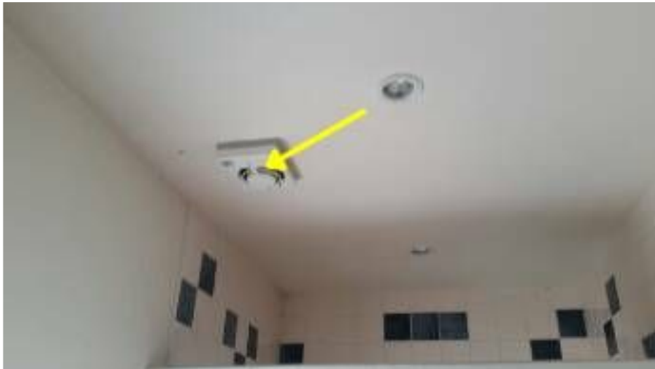
Vent from bathroom venting directly into attic, should vent out of attic space.