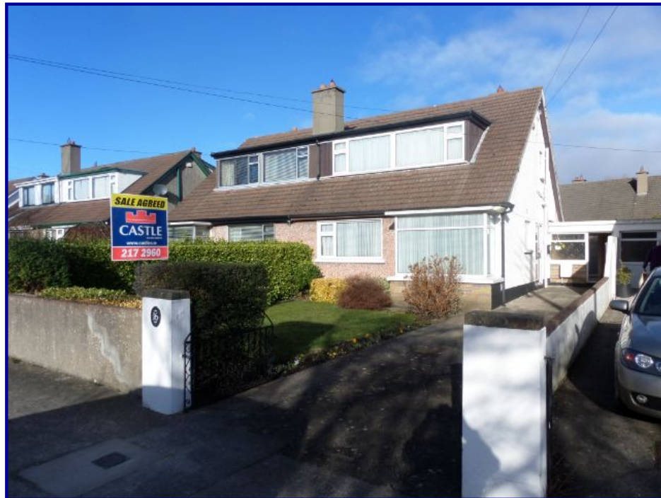
42 Old Street, Dublin

Inspection prepared for: Mr A Sample Date of Inspection: 14/4/2015