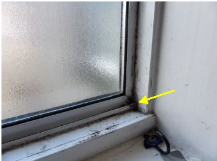
Mould around window frames.

1.2. Inadequate Ventilation in property , vent openings required in all rooms.