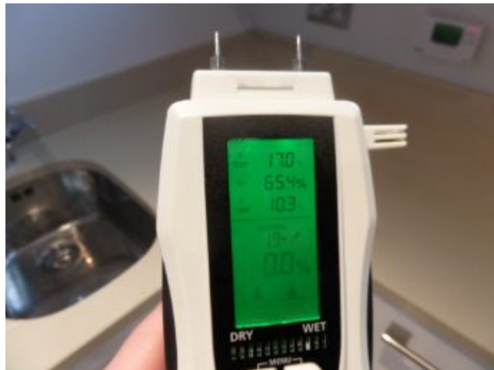
RH level in kitchen, c, 65 %