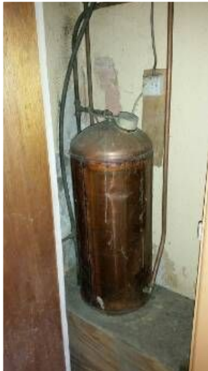
Aging copper cylinder.