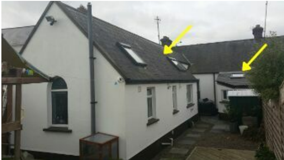
Rear extensions added.

3.3. I would recommend that a Certificate of Compliance with Planning Permission and compliance with Building Regulations be obtained from the vendor for the work/s listed above. Any certification available regarding interim inspections which may have been carried out during the course of the works should also be obtained.