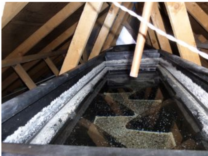
Cover required over water storage tank.