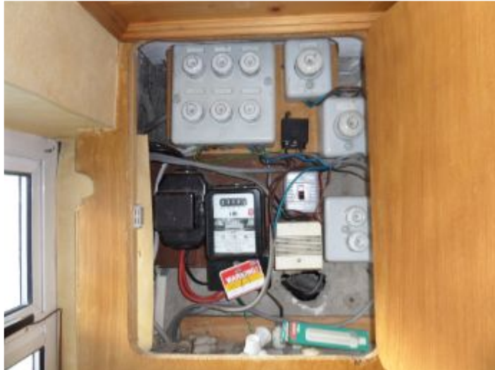
Main fuse panel.

3.1. Replace aging fuse panel with a modern breaker panel.