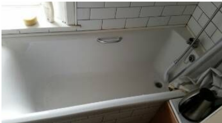
Re-seal around bathtub.