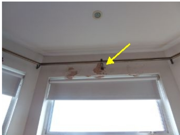
Moisture penetration through exterior wall.

8.1. Moisture penetration through exterior wall over front window.