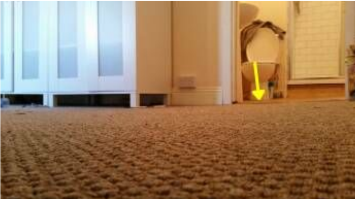
Slight slope in floor to upstairs bedroom.

5.5. Recommendation: Spraying recommended to floors as a precaution to eradicate common furniture beetle or other wood-boring insects often found in such buildings of this age. Quote to be sought from specialist with guarantee.