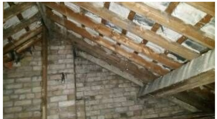
No collars fitted between roof rafters in roof structure, fit collars.