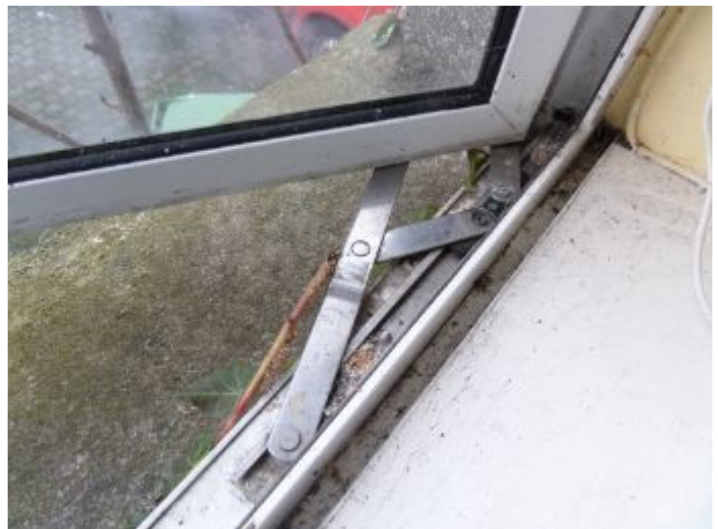
Window hinges require lubrication.