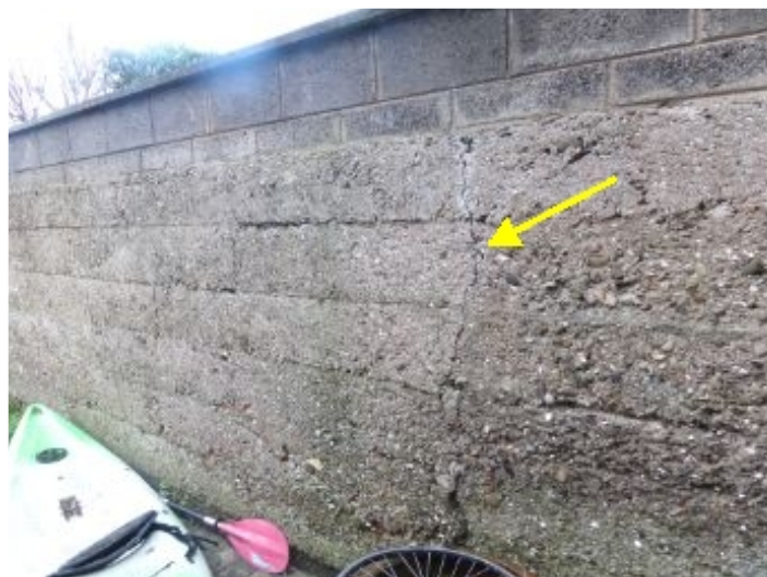
Crack in boundary wall.

4.2. Recommendation: Repair cracks in boundary walls.