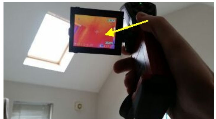
Insulation poorly fitted in sloped ceilings.