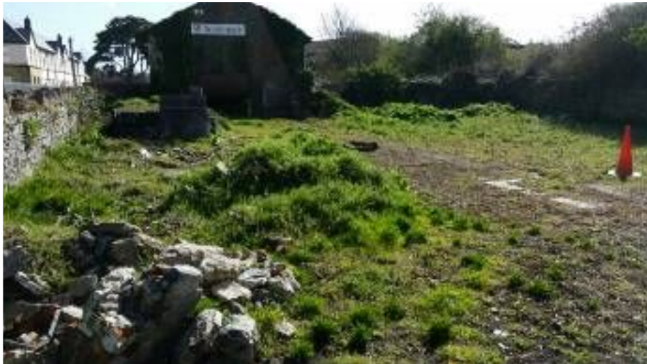
Boundary line not clear in back garden.