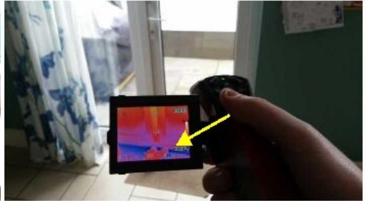
Minimum insulation to exterior doors.