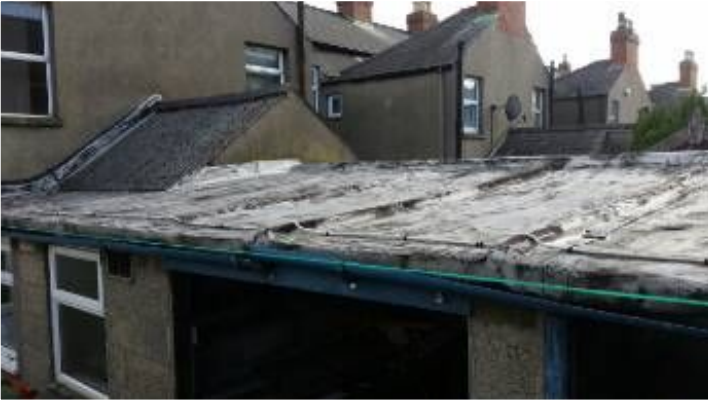
Roof covering aging.