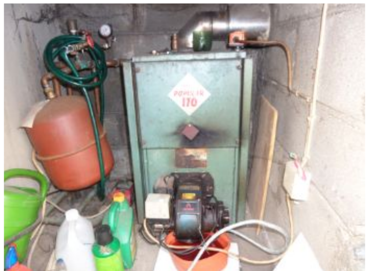
Full service required.