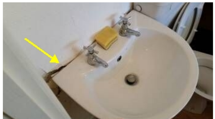
Secure loose w/h basin in in downstairs bathroom.