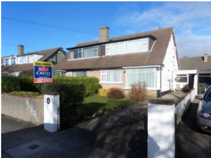
Front of property.