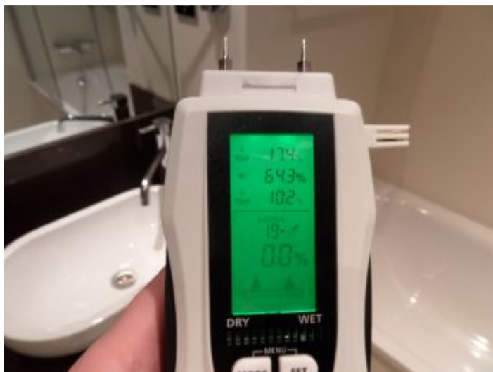
RH level in bathroom, c, 64 %