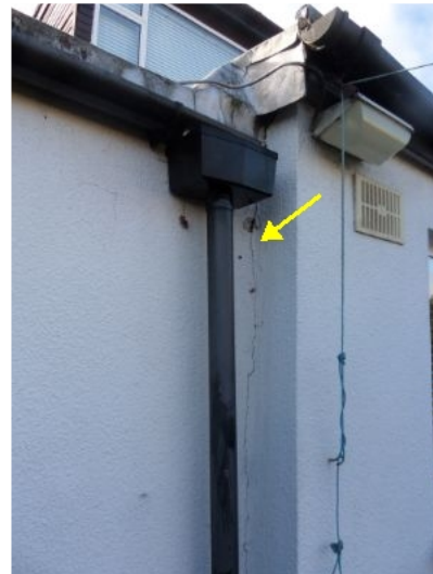
Cracks between the newer extension and the original building.