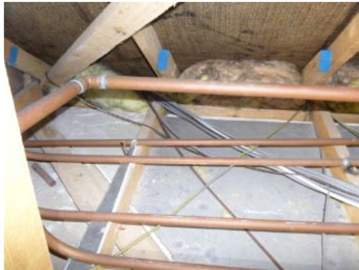
Insulate all plumbing pipes in attic.

8.1. Insulate all plumbing pipes in attic.