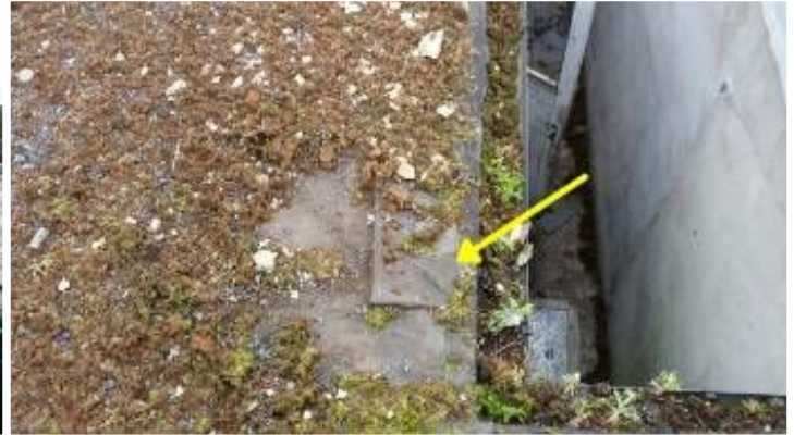
Previous repairs to flat roof.