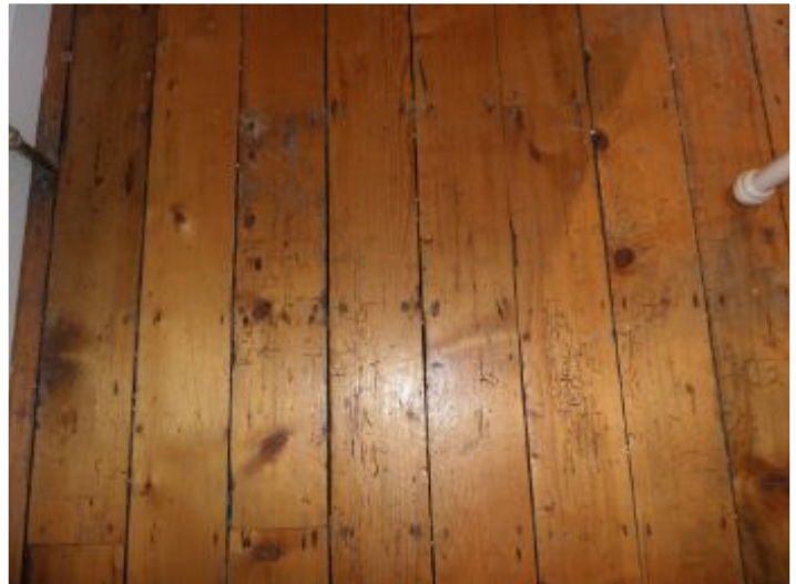
Dormant woodworm in floors.