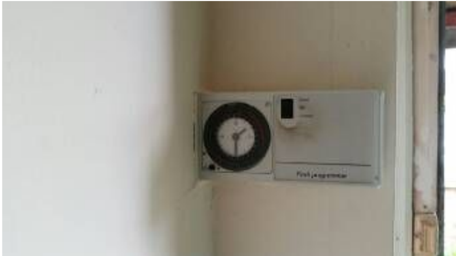
There is a basic programmer controlling the boiler.