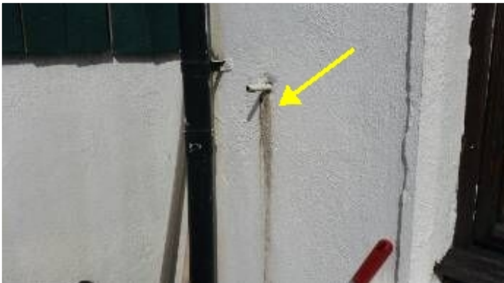
Water dripping out of pressure relief valve, indication of water over heating, service required.

1.5. Water dripping out of pressure relief valve, indication of water over heating, service required.