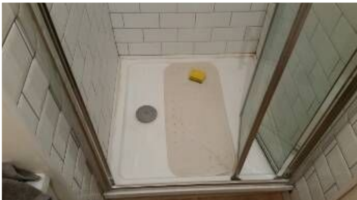
Re-seal around shower tray.