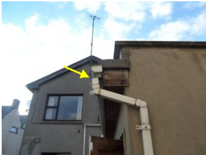
Secure downpipe at rear of house.