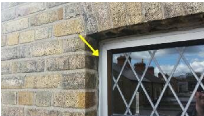
Re-seal around window frames to walls.

3.2. Window hinges require lubrication, will prevent windows from closing flush to window frames.