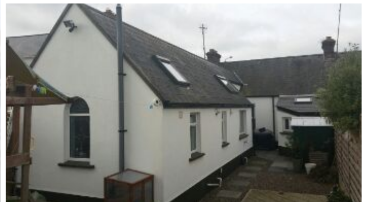
Back of Property.