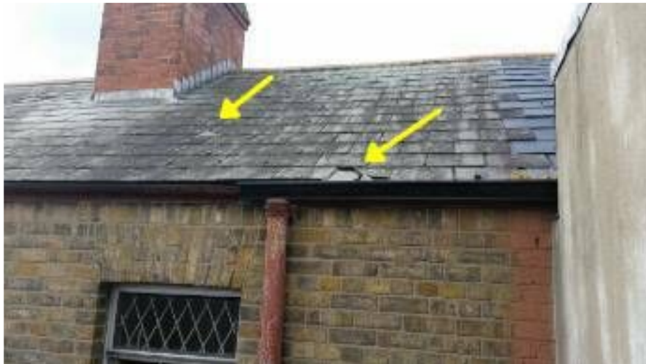
Slipped roof coverings.

1.1. Numerous slipped slates over main roof, repair in the short term.