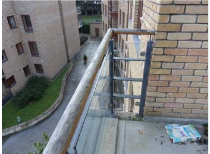
Sand down and re-paint timber handrail.