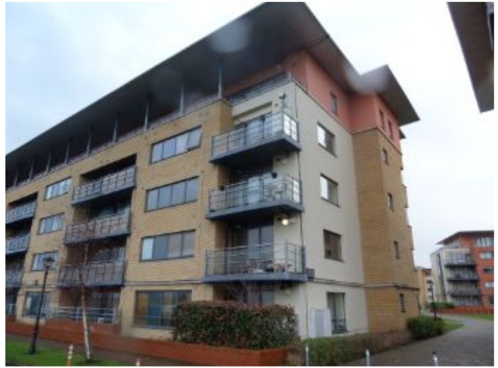
Back of Property.