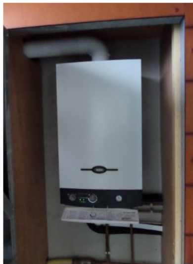
Normal service required.

1.3. Burner operating at time of inspection.