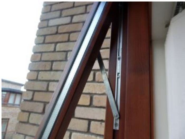
Window hinges require lubrication.

3.2. Hinges to windows will require lubrication, this will over time prevent windows from closing flush to window frames.