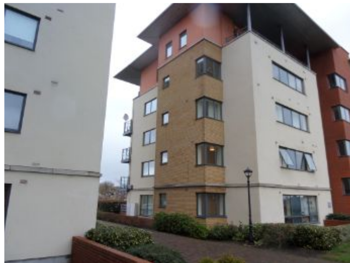
Left Side of Property.