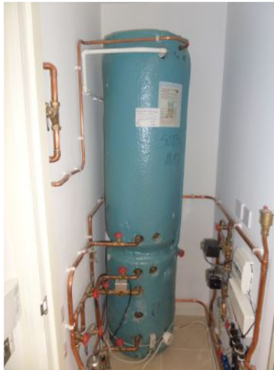
Water storage tank located in hotpress.

6.1. Water storage tank in hotpress would appear to be in a reasonable condition.