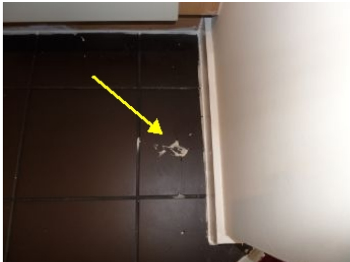
Replace cracked floor tile in kitchen.

5.1. Replace cracked floor tile in kitchen