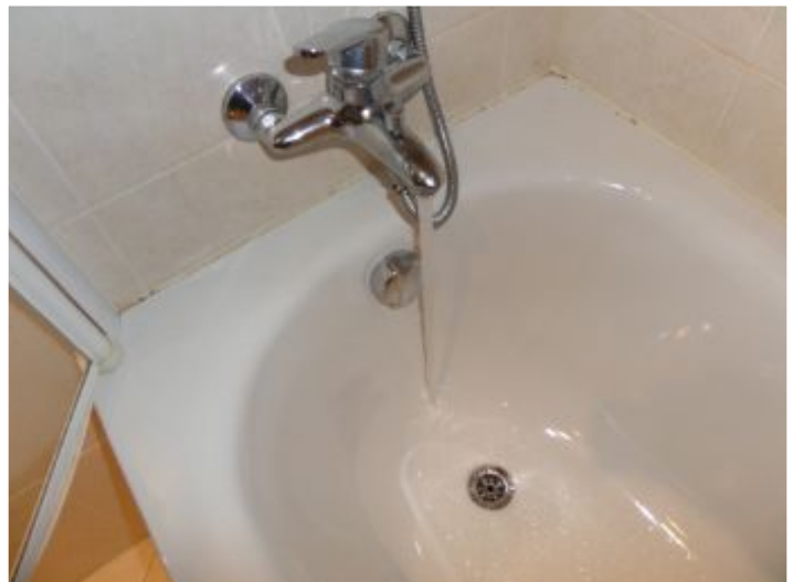
The taps are operating normally.