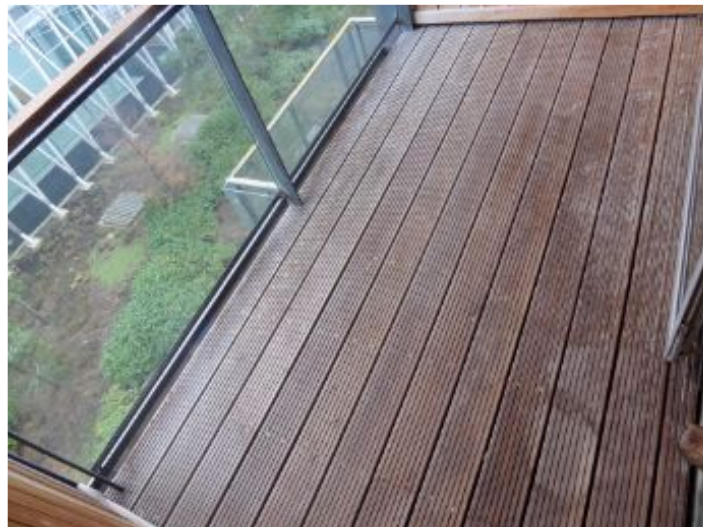
Timber decks are a safety hazard for slipping on when wet / damp.