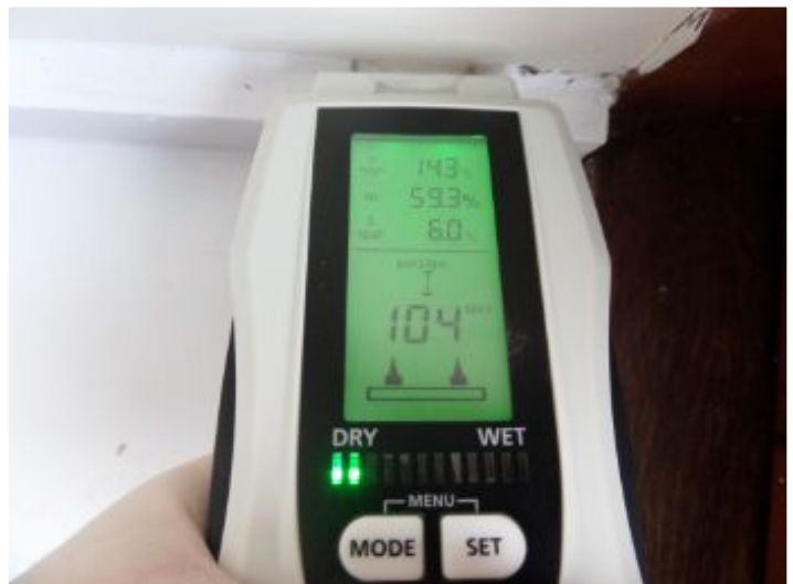
No moisture penetration through exterior walls.