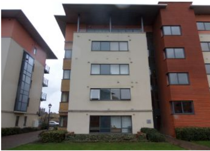
Front of property.