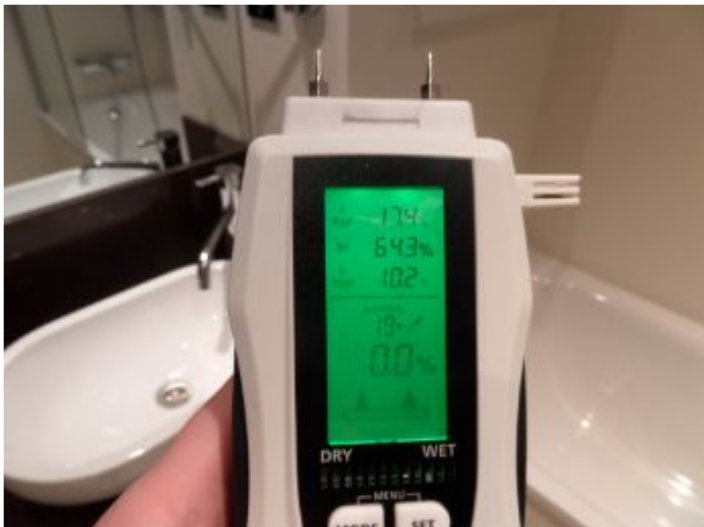
RH level in bathroom, c, 64 %