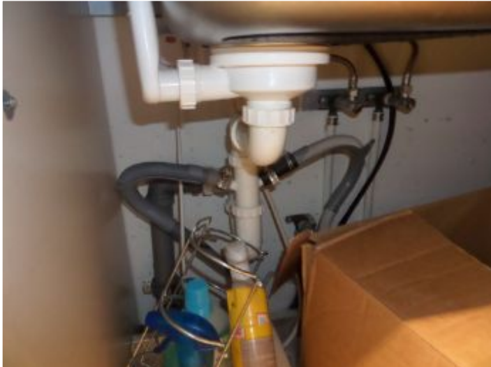
Plumbing pipes where visible would appear to be in a reasonable condition.

4.1. Plumbing pipes where visible would appear to be in a reasonable condition.