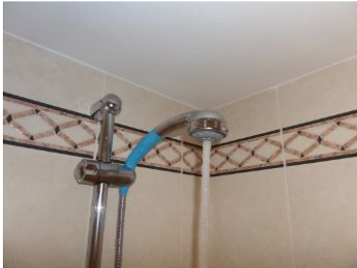
Shower operating normally.