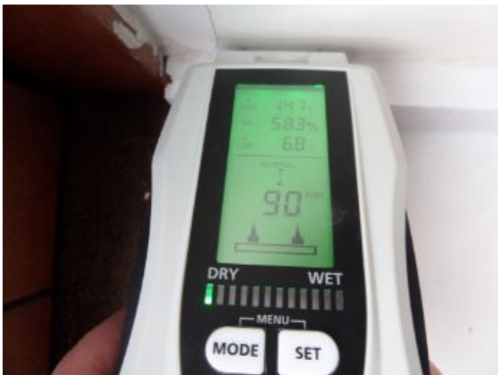
No moisture penetration through exterior walls.

7.1. No moisture penetration through exterior walls.