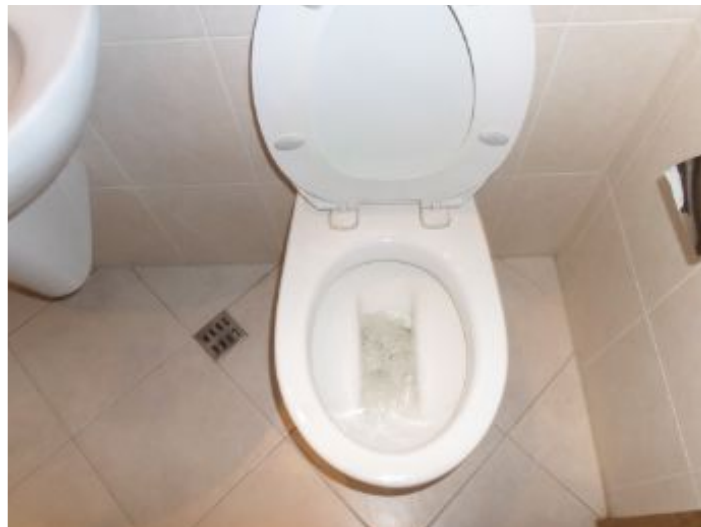
Toilet operating normally.

3.2. Monitor, seals around bathtub to wall in bathroom.