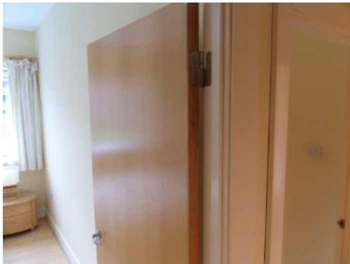
No automatic door closers fitted to fire doors.

4.3. Fire / smoke draft seals not fitted to door frames.