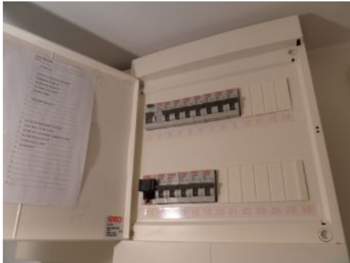
Main breaker panel.