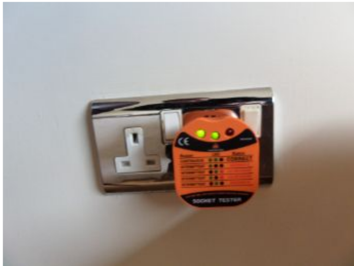
Wiring to plug sockets is earthed.