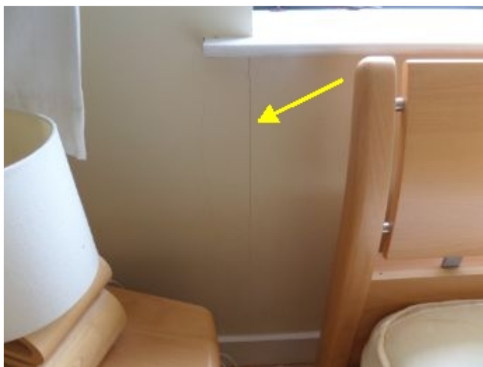
Drying cracks to interior walls.