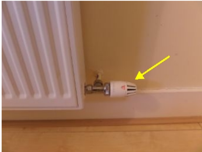
TRV 's fitted to radiators.