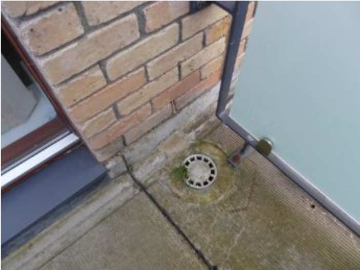
Keep drain in balcony free of debris.

4.2. Sand down and re-paint timber handrail to back balcony.