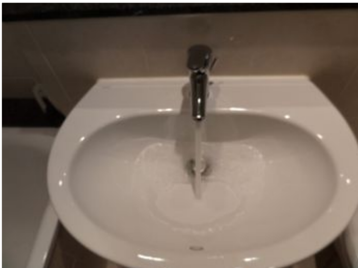
The taps are operating normally.