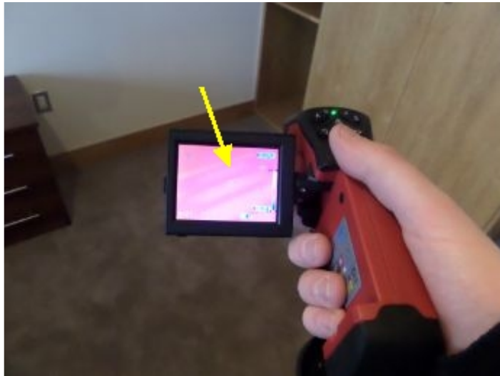
Under floor heating operating at time of inspection.

4.2. Recommendation: Under floor heating system should be serviced before closing.